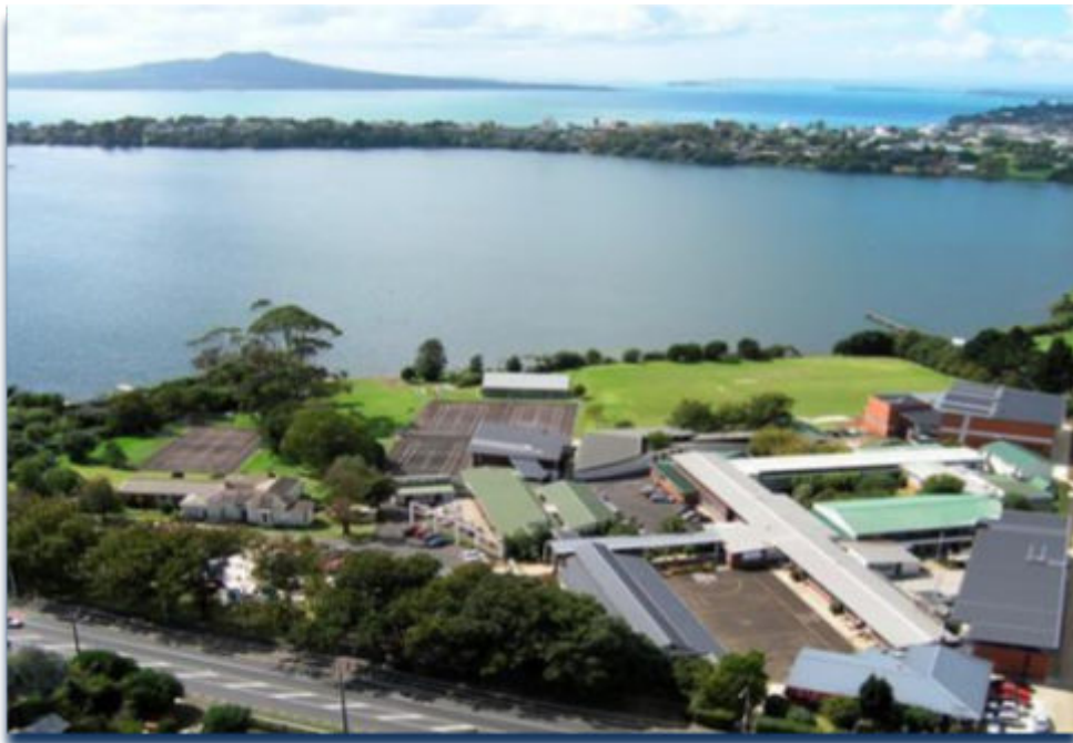
Aerial View of Carmel College beside Lake Pupuke. Rangitoto Island in the background